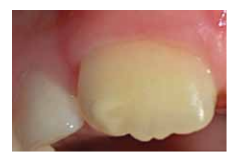
FIG. 2 Clinical appearence of hypomineralisation on incisor vestibular surface.

4. perhaps upregulation of secretory activity for enamel proteinases or molecules that activate them. Fully mature enamel represents a signal for ameloblasts to stop modulating and they undergo regression. Enamel biomineralisation differs from that of bone and dentin: for example, it starts its maturation immediately after ameloblasts lay down the enamel matrix and this matrix is transient, unlike the bone and the dentin. Dental enamel forms by the deposition of characteristic, non crystalline, mineral ribbons by a mineralisation front apparatus closely associated with the secretory surfaces of the ameloblast plasma membrane. The shape and orientation of enamel mineral ribbons is established at the mineralisation front and is not due to stereospecific inhibition of mineral deposition on selected crystal faces by acidic enamel proteins. The hierarchical organization of enamel ribbons into rod and inter rod enamel is